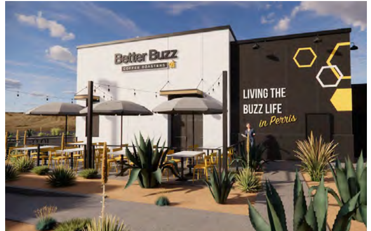
Renders by MyStudio